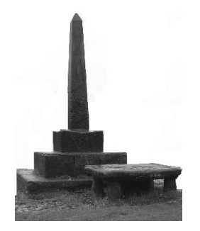
Issue 16 December 2023