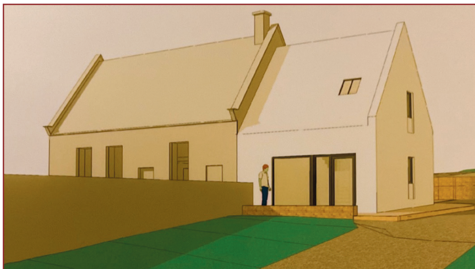
An artist's impression of the proposed new two-storey extension.

We have explored these proposals with the National Park Planning Team.