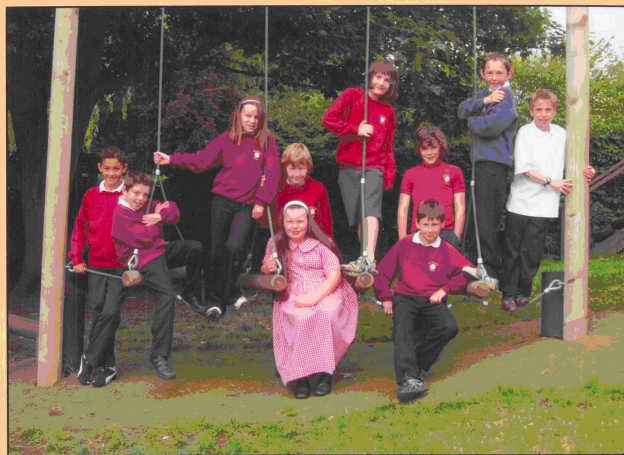
Osmotherley Primary School 2007

Hello again from the building site!!! As you can see the building work is progressing and is just about to schedule (for completion by the end of the summer holidays). The children have spent time planning the interior layout, these ideas have been discussed by the Governors and we are at the point of ordering furniture. The actual joining up of the buildings and knocking through will take place during the holidays which will minimise the disruption for the children.