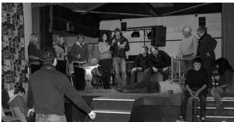
The Good Hope will be staged on Thursday to Saturday, 11 th , 12 th and 13 th Nov, in the Village Hall.